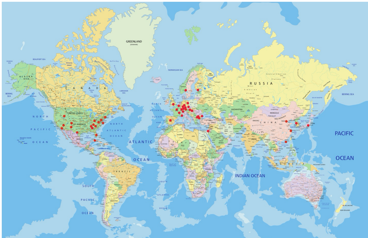
Figure 3. My activity in NPP Safety

SSTC NRS published the book series on the 30th anniversary of SSTC NRS (in Ukrainian). Among them, was the book [30] prepared by SSTC NRS Kharkiv subsidiary with the results of our works devoted to NPP I&CS safety.