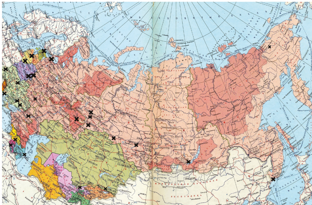
Figure 1. The map of USSR with marked places of trips

Organization - State Scientific and Technical Center for Nuclear and Radiation Safety (SSTC NRS), also subordinate to the National Academy of Sciences of Ukraine.